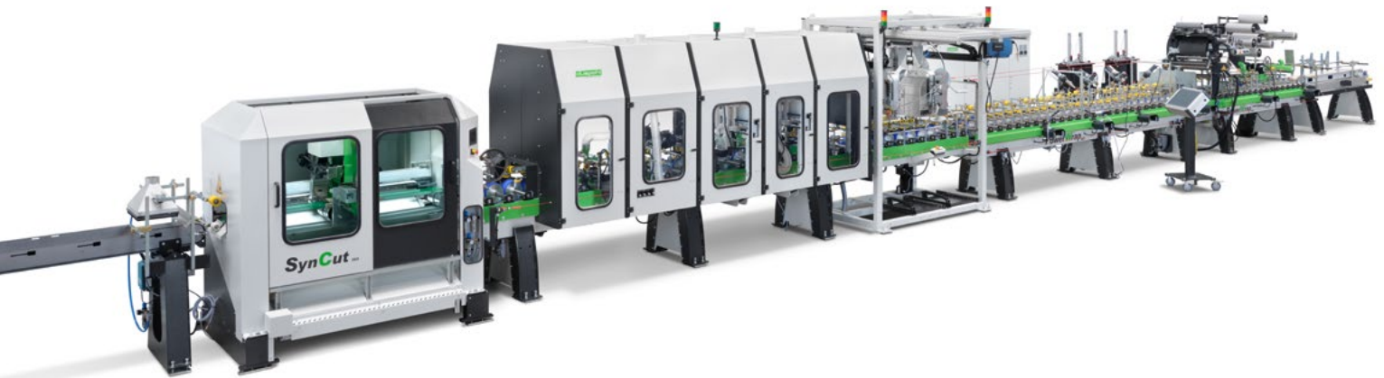
PICTURE: PowerWrap Wood 400S with UniMelt 160, ReelChange Wood, trimming station and SynCut 360